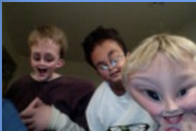
Middle School Lock in - Aliens!