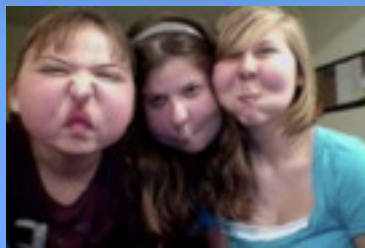
Middle School Lock in - Chipmunks!