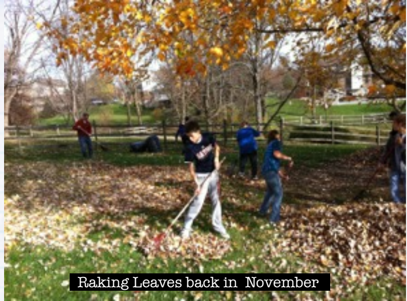
Raking Leaves back in November